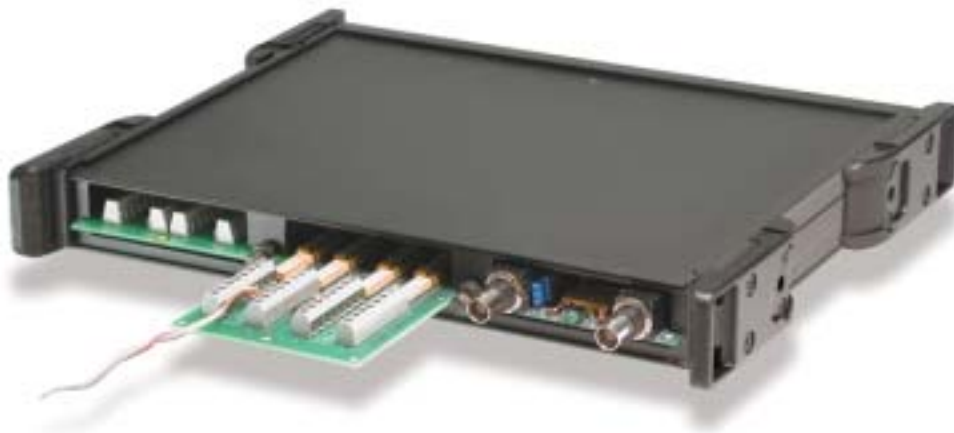
The DBK10 provides three slots for IOtech's DBK expansion cards

Weight: 1.3 kg empty (3 lbs); cards 0.25 to 0.75 kg each (8 to 12 oz)